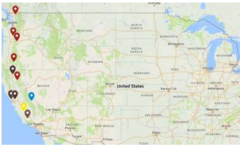
A map created from the landmarks mentioned in Wendy Rose's "What Distinguishes Sunset in Seattle from Sunset in Chicago".

In her poem "What Distinguishes Sunset in Seattle from Sunset in Chicago,"