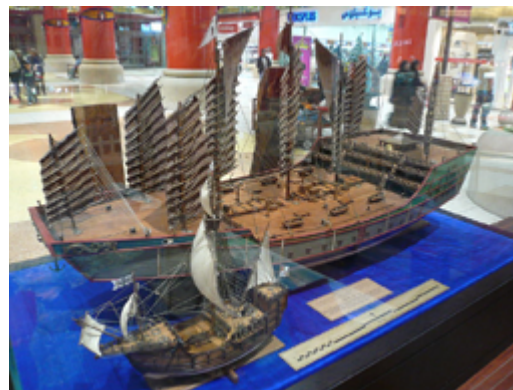
Figure 2.2 Zheng He’s Ships | A comparison shows how Zheng He’s treasure ships dwarfed Columbus’s ships.

One shipyard near Nanking alone built 2,000 vessels, including almost a hundred large treasure ships. The latter were approximately 400 feet long and almost 200 feet wide. Dragon eyes were carved on the prows to scare away evil spirits. 7 Anatole reminds us that “The large Chinese ships, majestic and impressive, and more than enough to fill with awe a country of lesser stature than the mighty Ming, were first and foremost built for military personnel transport.” 8