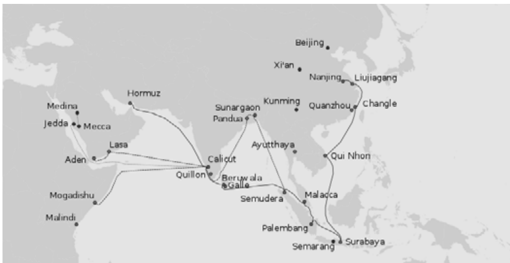
Figure 2.3 Zheng He's Seventh Expedition | This Map shows the route of the seventh voyage of Zheng He's fleet, 1431-1433.

Although the Chinese were interested in the products of other cultures, and though Zheng He brought to China an Arab book on medical remedies, a giraffe, and "300 virgins," Yung Lo's successor, Zhu Zhanji, decided in 1433 to disband this naval effort and "never again were the expeditions resumed." Several possibilities explain this occurrence: the Chinese found nothing in the cultures visited that they could not obtain through trade; after Zheng He's death, no admiral rose to his stature as a sailor; or, according to Fairbank, "anti-commercialism and xenophobia won out." 11 Whatever the reason, the Chinese armada was allowed to fall into disrepair, service