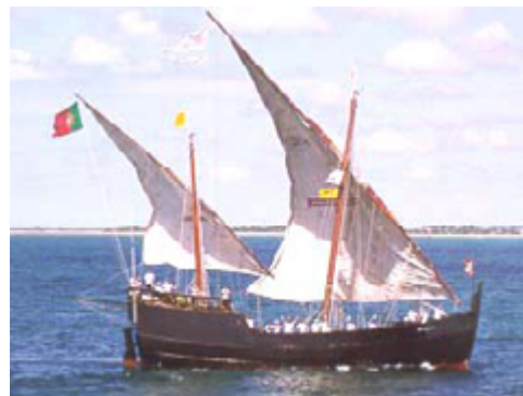
Figure 2.1 Caravel Boa Esperança of Portugal | The triangular sailed, square rigged caravel was quick, agile, and seaworthy.

Like the Spanish and other Europeans, the chief desire of the Portuguese was to tap into the lucrative