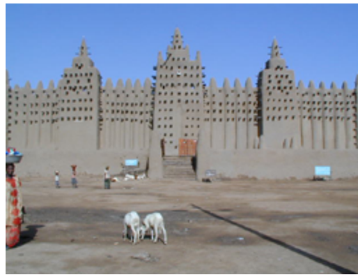
Figure 2.4 Great Friday Mosque at Jenne | Mansa Musa established control over Jenne, and upon his return from the pilgrimage to Mecca, he brought an Egyptian architect by the name of al-Saheli whom Mansa Musa paid to create mosques at several cities; the Friday Prayers Mosque was one of these. Mansa Musa also built a royal palace (or Madugu) in Timbuktu. The mosque was completed in the late fourteenth/early fifteenth century.

By 1200, the kingdom of Ghana was in decline as political disintegration saw the rise of several petty kingdoms led by warlords. Eventually one people, the Mandinka, asserted themselves over the others and created a new kingdom, Mali, built on the foundations of Ghana. Historians usually point out that the strength of Mali lay in part in the accession to the throne of two powerful leaders: Sundiata Keita and Mansa Musa. It was through the efforts and resourcefulness of these two men that a strong, vibrant kingdom was created.