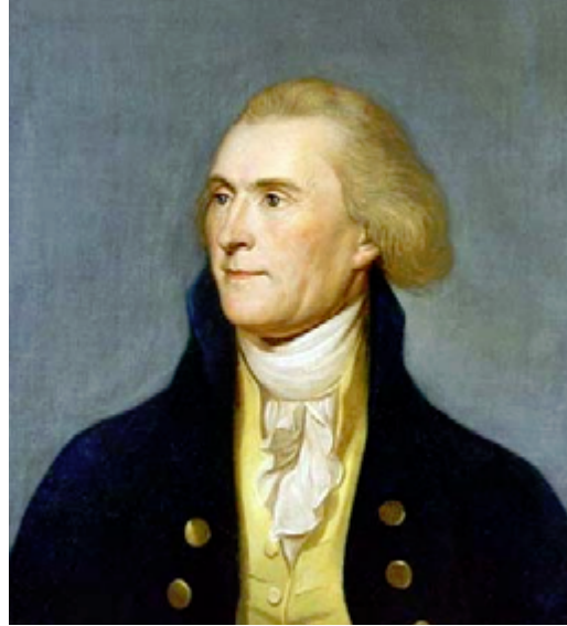
Figure 9.4 Jefferson and the Constitution | Thomas Jefferson, one of the authors of the Declaration of Independence, was not present at the Constitutional Convention, but closely monitored its proceedings from France.

Americans were not present at the convention: Thomas Jefferson, who, along with Benjamin Franklin, Robert Livingston, and John Adams had drafted the Declaration of Independence , was in France, John Adams was in Europe trying to raise money to pay off war debts, and Patrick Henry, who distrusted all centralized governments, refused to participate, claiming he “smell[ed] a rat.” Both Jefferson and Adams, however, kept a close eye on developments in Philadelphia.