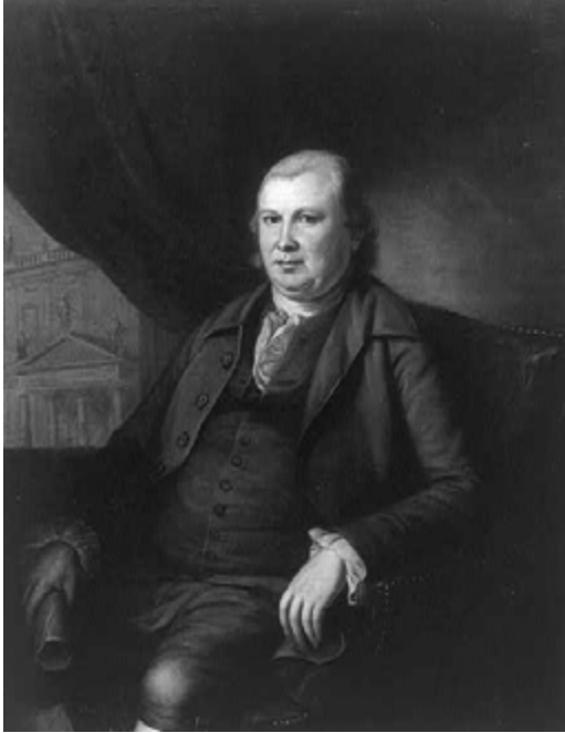
Figure 9.2 Dealing with the Nation's Debt | Robert Morris, a Pennsylvania merchant, served as the first minister of finance for the Confederation Congress from 1781 to 1784. During that time he struggled in vain to devise an acceptable plan to fund the nation's debt.

Artist: Charles Willson Peale