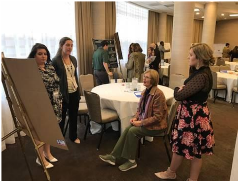
2017 Convention attendees enjoy presentations during the Student Poster Session.

The 2021 Student and Chapter Poster Session will be held during the 2021 Virtual Triennial International Convention this November 3-6. Poster proposals are being accepted now.