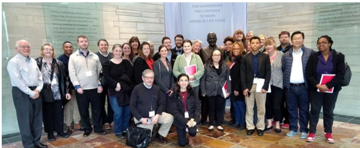
2017 Leadership Development Program Participants attend a decision-making simulation at the Truman Presidential Library's White House Decision Center in Independence, MO.

Join us for the second Leadership Development Program during the 2021 Virtual Triennial International Convention! Program participants will learn about leadership in a variety of different contexts to include leadership in academia, stressful environments, non-profit organizations, public policy and in the United States Marine Corps. The virtual event will consist of webinars, lectures, and a unique online experience with the National Museum of the Marine Corps in Triangle, Virginia. While the program is tailored for undergraduate students, graduate students are welcome to attend. Students will earn a certificate of completion for their resume upon the conclusion of the program.