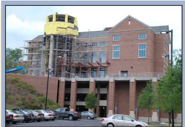
New Recreation Center and Parking Deck

öküü"pgeguuct{ "vq"dg" f{ pc o ke"kp"cp{ "gpxktp o gpv"vq"mggr" wugtu"eq o kp i" dcem0"Qwt"ck o "ku"vq"etgevge"cp"cv o qur jgtg"vjcv" students will come back to again and again," Tonner said. — JP