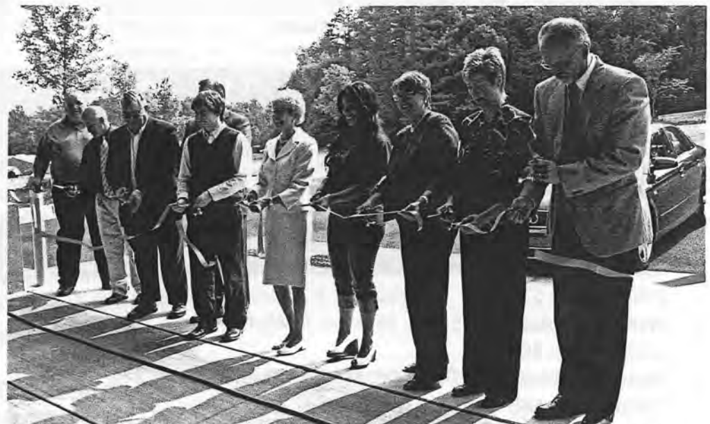
Student Parking Deck Dedication Ceremony—July 8, 2009