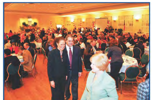
2009 Annual Dinner

A restructured February event will return in 2011 as an annual gala and fundraising event.