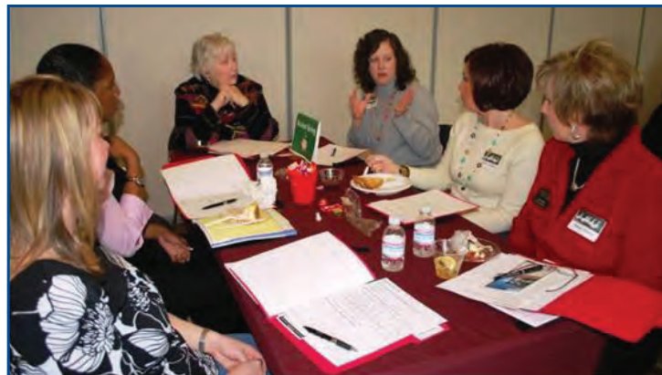
A Group of Council members discussed ways to engage current GSC students in giving to the Alumni Association.