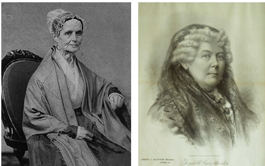
Figure 13.2 Lucretia Mott and Elizabeth Cady Stanton | These two women were instrumental in organizing the Seneca Falls Convention and writing the Declaration of Sentiments, which would articulate the goals of the women's rights movement.

Author: Unknown (Mott), Carol M. Highsmith (Stanton) Source: Library of Congress